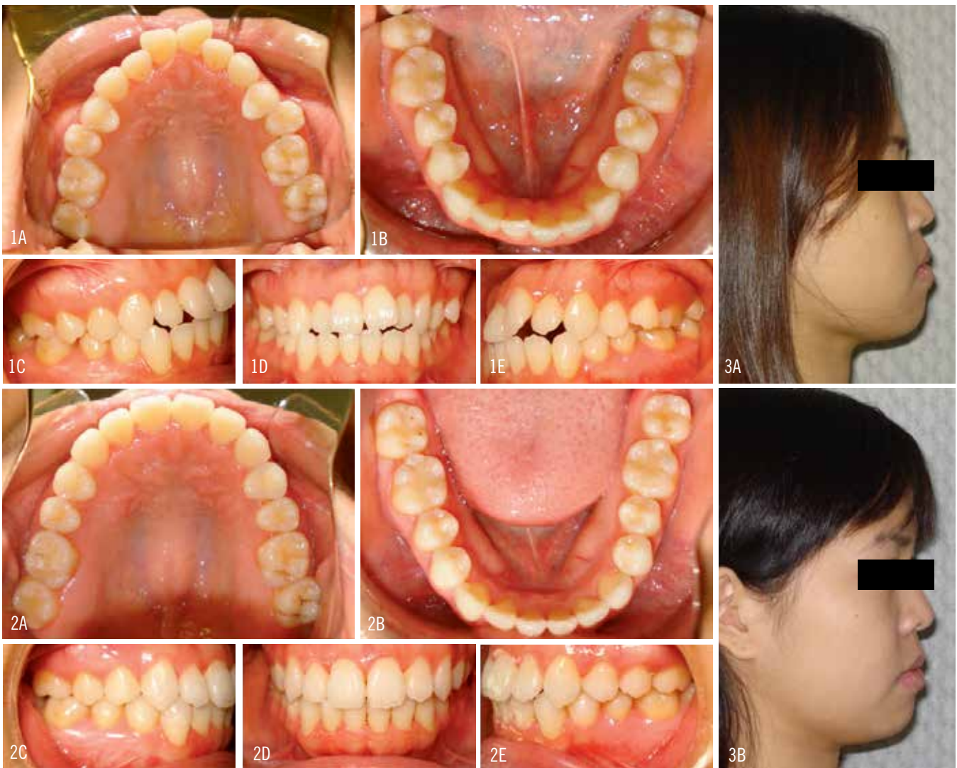
Case 3. Patient presented with facial and mandibular asymmetries, buccal crossbite of number 13, and cant to the smile line with a protrusive lip, as seen in figures 1A-1E and 3A. Figures 2A-2E and 3B show the results of treatment. Treatment time was 14 months with no IPR or refinement.

cases. The challenge is to deconstruct the interactions of the archwire in the bracket slot that we take for granted every day and translate those mechanics into Clincheck design.